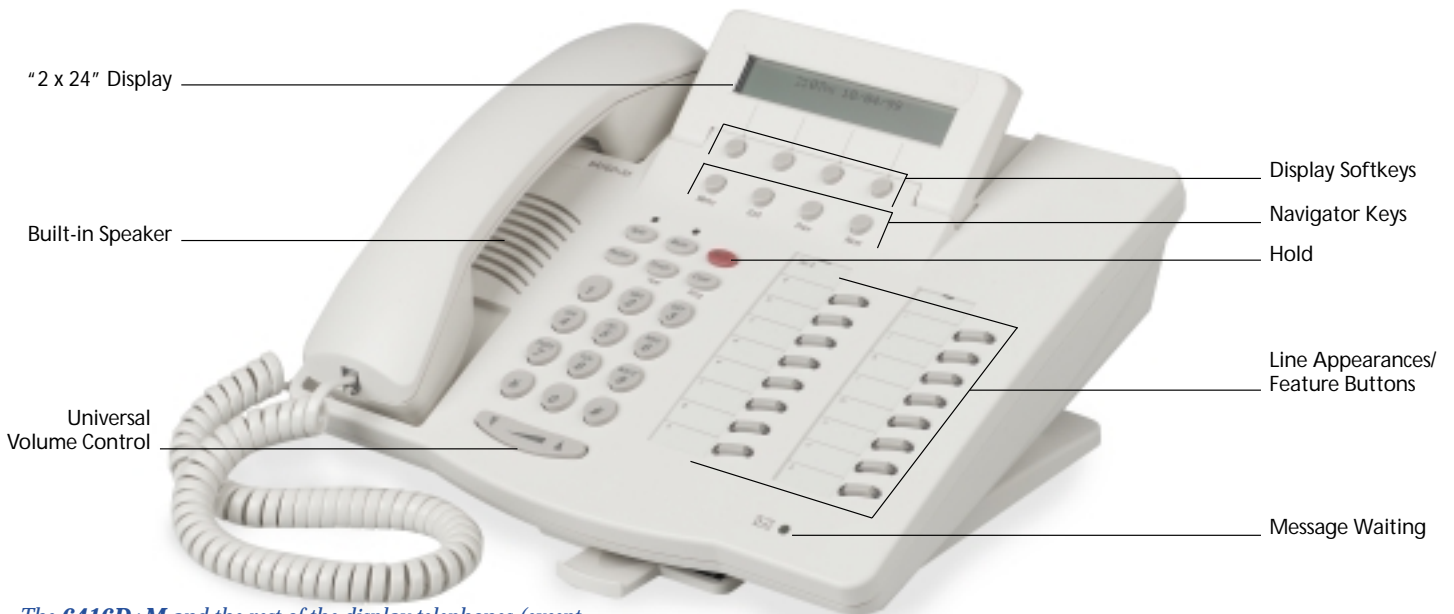
The 6416D+M and the rest of the display telephones (except 6402D) include four softkeys that make it easy to access and program system features, allowing users to personalize each phone to meet individual needs.

The 6400 Digital Telephones also improve productivity and allow for one-touch operation with headsets—so you can answer, hang up, and dial without having to pick up the